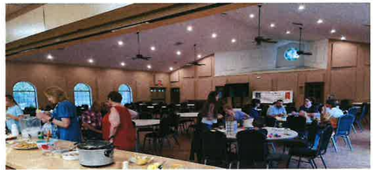
Easter dinner - Parish pot-luck dinner style.

JESUS CHRIST HAS RISEN TODAY— ALLELUIA! ALLELUIA!