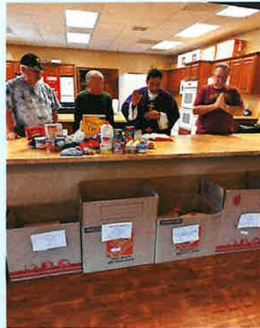
Easter Box Blessing