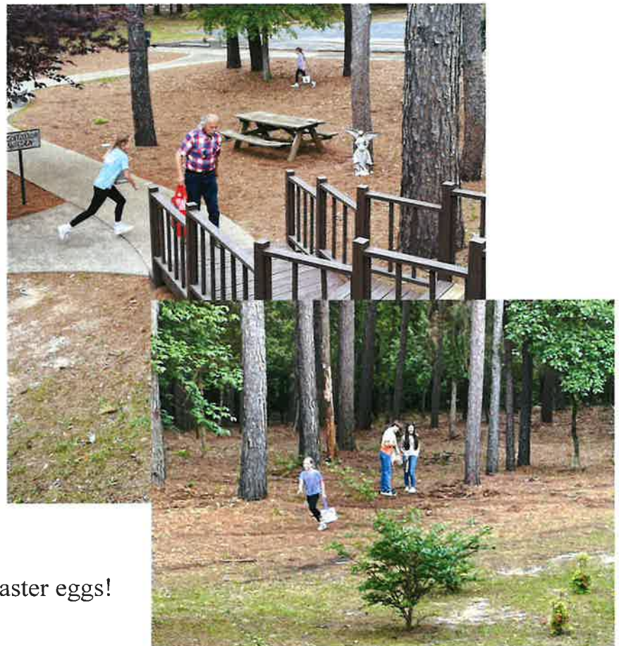
Hunting for Easter eggs!