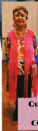
Queen of COOL